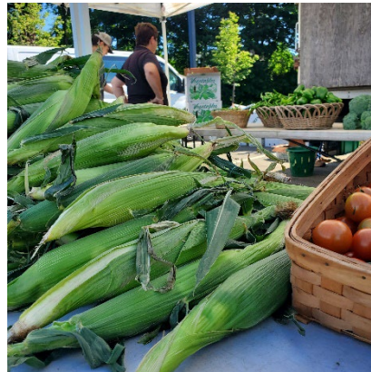
A variety of seasonal fruits and vegetables from Gresczyk Farms and corn from Twin Pines Farm will be available at the 2023 Bristol Farmers Market.