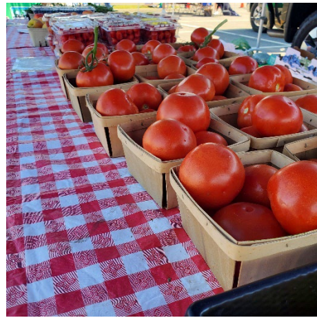
Fresh tomatoes from Tonn's Orchard and Marketplace will be for sale again this year at the Bristol Farmers Market.