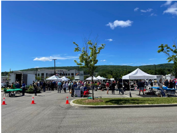
The Bristol Farmers Market will be held at the Bristol Health Medical Care Center's parking lot in Centre Square once again for the 2023 season.